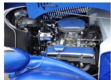
Name: Richard Willis Where: Paris, KY car show Camera: Nikon D90 Lens: Nikon DX 18-105 Focal length: 18mm Shutter: 1/250 f/stop: f/5.6 ISO: 640