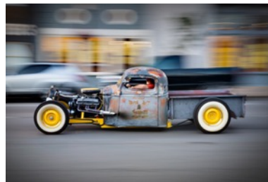
Name: Bill Cole Where: Triangle Park Lexington Camera: Canon 5Dm3 Lens: Sigma 50mm art Focal length: 50mm Shutter: 1/15 f/stop: f/7.1 ISO: 250