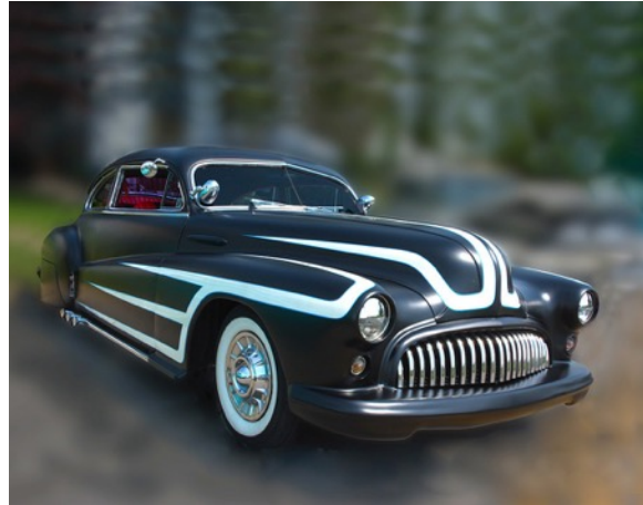
Name: Terry Bailey Where: Hot Rod Hullabaloo, Lexington Ky. Camera: Nikon7100D Lens: Nikon 18-300 Focal length: 18mm Shutter: 1/25 f/stop: f/18 ISO: 100