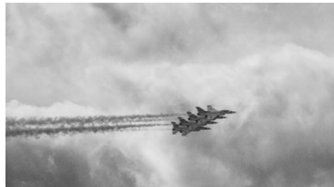
Name: Jeff Gitlin Where: not provided Camera: Canon 70D Lens: not provided Focal length: 151mm Shutter: 1/8000 f/stop: f/11 ISO: 1600