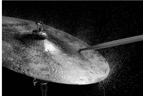
Name: Bill Cole Where: not provided Camera: Canon 5D Mark III Lens: not provided Focal length: 100mm Shutter: 1/125 f/stop: f/13 ISO: 250