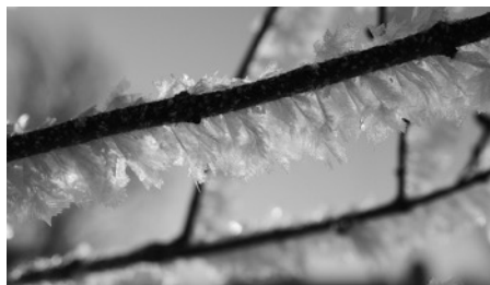
Name: Claudia Banahan Where: my home in Bourbon County Camera: Nikon D7100 Lens: not given Focal length: 60mm Shutter: 1/1250 f/stop: f/11 ISO: 100