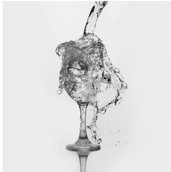
Name: Bill Cole Where: Lexington, Kentucky studio Camera: Canon EOS 5Dm3 Lens: Canon 100mm f/2.8L Macro in non macro mode Focal length: 100mm Shutter: 1/160 but hi speed strobe made effective shutter speed of 1/10,753 f/stop: f/11 ISO: 250