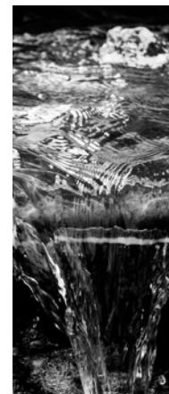
Name: Lori Rivera Where: not given Camera: Canon 20D Lens: not given Focal length: 35mm Shutter: 1/500 f/stop: f/8 ISO: 800